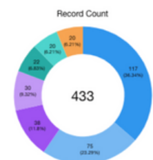
Rental History by Customer