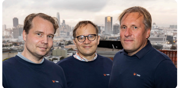
Valo.ai was founded by cloud & cybersecurity product veterans behind Salesforce Platform Security, Salesforce Shield and F-Secure Cloud Protection

Valo delivers real-time Salesforce security, cost-cutting, and productivity capabilities to keep your organization current -- and running optimally -- even as agent and app complexity intensifies.