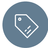
CPQ, BILLING & CLM