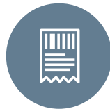
B2C COMMERCE CLOUD