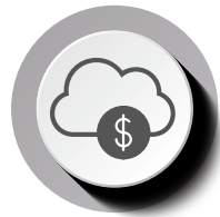
FINANCIAL SERVICES CLOUD