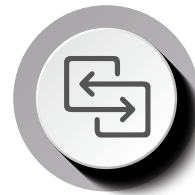
MERGING SALESFORCE CRMS