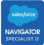
Core Messaging/ Journeys