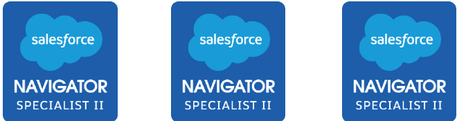
Flow Integration Services Platform