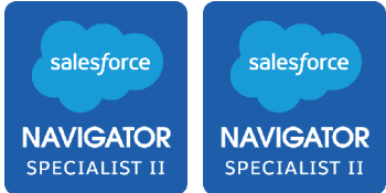
Sales Cloud CPQ