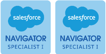
Partner Relationship Management Customer Portal Including Self Service