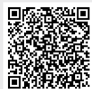
Hover camera over code to learn more