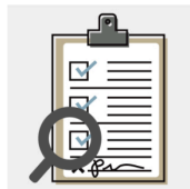
Get Offers on Your Home

We have the largest selection of home staging furniture, designer artwork and decor accessories. Nobody stages more real estate than White Orchid Interiors.