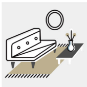
Get Staged for Sale

Our interior design stagers offer the best value and are trusted by more real estate professionals